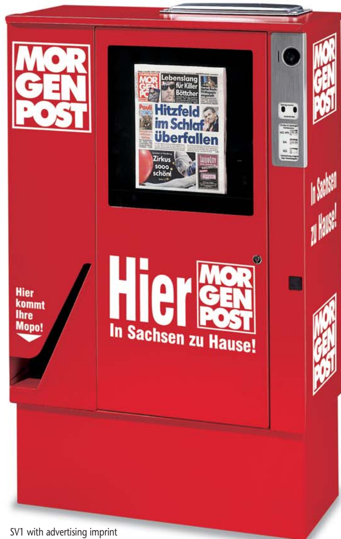
SV1 with advertising imprint