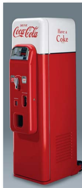
special design only for USA 3)