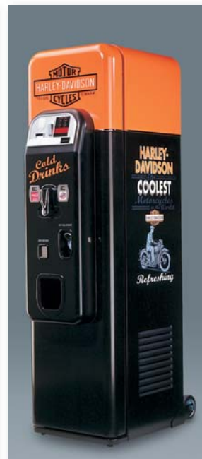
Some examples for special versions with individual branding