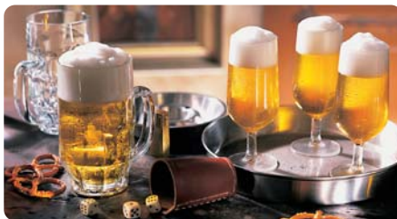
Gastronomic motif: beer