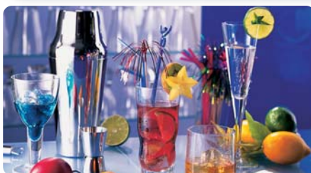
Gastronomic motifs: wine and bar or drinks