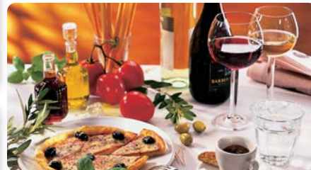
Gastronomic motif: Mediterranean